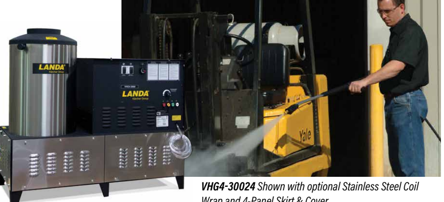
Wrap and 4-Panel Skirt & Cover

Compact but heavy duty, this natural gas model's footprint is a mere 24" x 53" for the smallest unit, making it an ideal choice for congested work areas or wash bays where space is at a premium. The small size makes it no less efficient; with cleaning power up to 3000 PSI and 8 GPM, this machine delivers enough cleaning action to tackle a variety of challenges, and includes an optional wireless remote control. The VHG is especially adept at cleaning and maintaining the appearance of the dirtiest fleet or construction equipment.